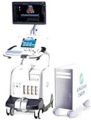
Image below: A typical cart-based ultrasound system (left) with a conceptual illustration of ENDRA's first-generation technology (right). Other components in development include a hand-held RF applicator with a screen depicting TAEUS information.

In 2010, we began marketing and selling our Nexus 128 system, which combined light-based thermoacoustics and ultrasound to address the imaging needs of researchers studying disease models in pre-clinical applications. Building on this expertise in thermoacoustics, we have developed a next-generation technology platform — Thermo Acoustic Enhanced Ultrasound, or TAEUS — which is intended to enhance the capability of clinical ultrasound technology and support the diagnosis and treatment of a number of significant medical conditions that require the use of expensive CT or MRI imaging or where imaging is not practical using existing technology. We believe that our TAEUS technology, which can be used with existing ultrasound equipment and incorporated into next-generation ultrasound systems, has the potential to make advanced imaging available in certain applications to a wider range of patients on a more cost-effective basis than is possible using existing CT and MRI technology.