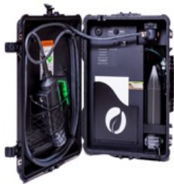
SteraMist™ Surface Unit

Our SteraMist™ Surface Unit is lightweight, easy to transport and capable of achieving reliable disinfection/decontamination results, as it is easily incorporated into existing cleaning procedures and protocols. It can be used as a standalone terminal clean product or as an adjunct to ultraviolet disinfection. The SteraMist™ Surface Unit produces hydroxyl radicals through its plasma science and does not require heating, ventilation or air conditioning systems to be shut down. Additionally, it requires no wiping, leaves no residue and is free of bleach, chlorine, formaldehyde, glutaraldehyde, titanium dioxide, peracetic acid and silver ions.