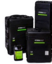
SteraMist™ Environment System

We also offer customized disinfection and decontamination applications in healthcare, pharmaceutical, vivarium, clean room and bio-safety facilities throughout the world using our SteraMist™ technology. In these customized, built-in applications, our SteraMist™ technology is integrated into full rooms, pass-boxes, chambers, bag in/bag out and other enclosures.