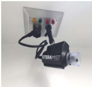
Customized Built In Unit

We also offer customized disinfection and decontamination applications in healthcare, pharmaceutical, vivarium, clean room and bio-safety facilities throughout the world using our SteraMist™ technology. In these customized, built-in applications, our SteraMist™ technology is integrated into full rooms, pass-boxes, chambers, bag in/bag out and other enclosures.