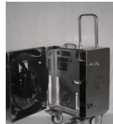
SteraMist™ Surface Unit