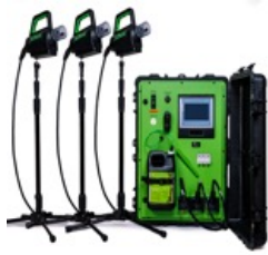
SteraMist™ Environment System

Our SteraMist™ Environment System is a transportable, remotely-controlled (robotic) system that provides complete room disinfection/decontamination of a sealed space up to 103.8 m 3 (3,663 ft 3 ). Individually, each remote applicator can be used to treat a space of approximately 34.6 m 3 (1,221 ft 3 ). Multiple SteraMist™ Environment Systems can be used simultaneously to accommodate larger or multiple spaces with fast application and minimal down time. Our hybrid technology applicators can be used in manual and/or fogging modes.