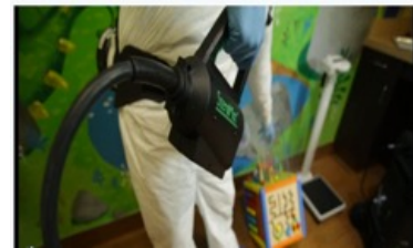
SteraMist™ Service Technician

Domestically, we are focused on the health care and hospital, bio-safety and pharmaceutical markets, along with other verticals that are covered through our professional service division. Internationally, we seek strategic partners, manufacturer representatives or licensed distribution partners and are currently focused on Asia, the European Union, the Middle East, Central America and Mexico. In such international markets, our technologies are used for the control of microorganisms and the decontamination of large and small indoor spaces for biological pathogens and chemical agents, including infectious diseases in hospitals, bio-secure labs and pharmaceutical manufacturers, biodefense and biosafety facilities (including isolation and transfer chambers), tissue banks, food safety and many other commercial and residential settings. Our marketing and strategic partnership agreements have focused on Singapore, the Philippines, Taiwan, Hong Kong, South Korea and Japan, particularly in light of past MERS and severe acute respiratory syndrome (SARS) epidemics.