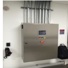
Customized Built In Unit

We offer complete decontamination and disinfection services in residential and commercial industries through the use of our SteraMist™ BIT™ platform of products, in-house technicians and the TOMI Service Network (described below). We specialize in providing these customized services in medical facilities, bio-safety labs, tissue labs, clean rooms, office buildings, hospitality, schools, pharmaceutical companies, remediation, companies, military, transportation , airports, first responders, single-family homes and multi-unit residences.