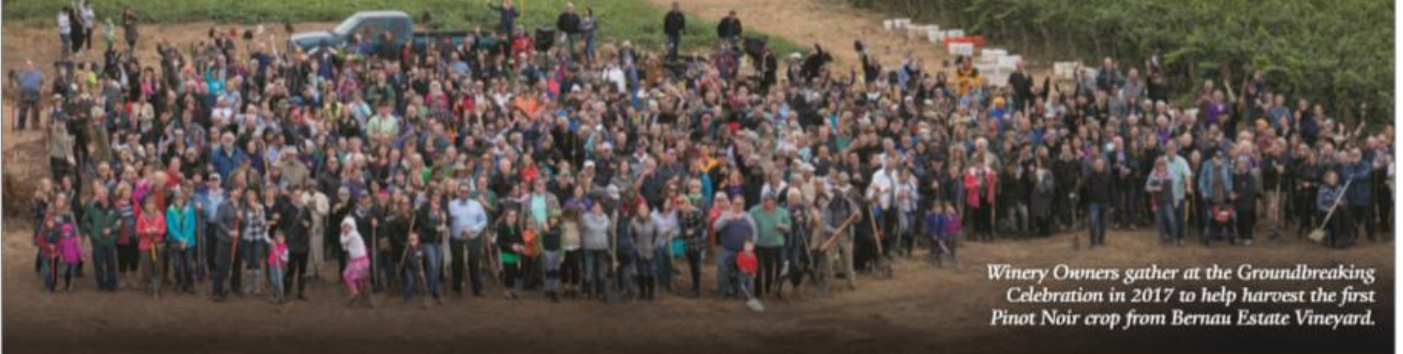
Winery Owners gather at the Groundbreaking Celebration in 2017 to help harvest the first Pinot Noir crop from Bernau Estate Vineyard.

Join us as a Winery Owner in one of Oregon's leading wineries!